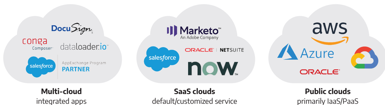
Figure 2: Multi-cloud, SaaS & public cloud environments

A major challenge for any digital transformation initiative is to manage public cloud environments and the addition of new security tools and application architectures. Organizations are transforming IT to support new digital business processes and are migrating their on-premise applications to a public cloud such as Amazon Web Services (AWS), Microsoft Azure, Google Cloud, etc. for advantages in cost, efficiency and scale. They are also incorporating Software-as-a-Service (SaaS) solutions or multi-cloud resources that add value to their cloud-based applications.