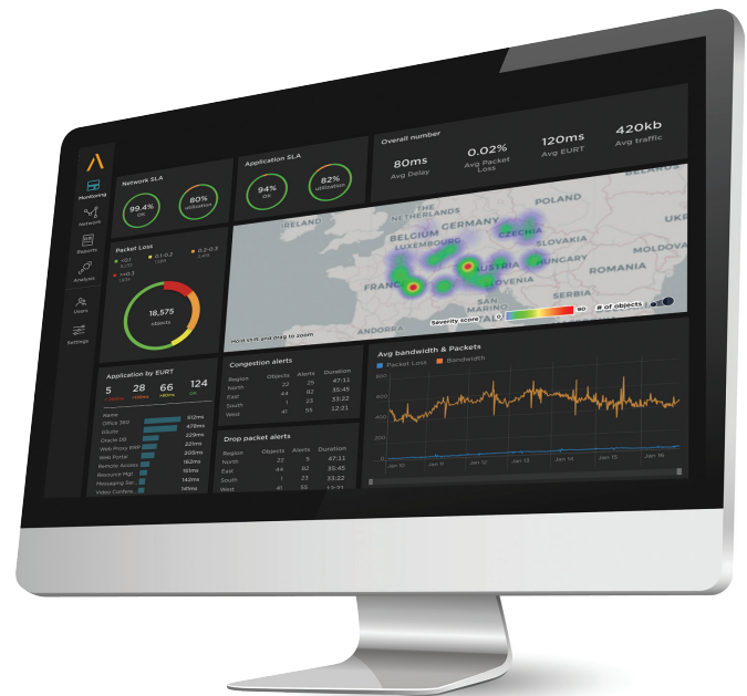
Figure 1: Skylight provides comprehensive visibility into network performance and end user experience with combined active and passive performance data

Even more advantageous, the platform gives IT operations teams a single, unified view of how their network is behaving and how end users are experiencing the network. This enables the prioritization of the most severe customer-impacting issues for immediate resolution.