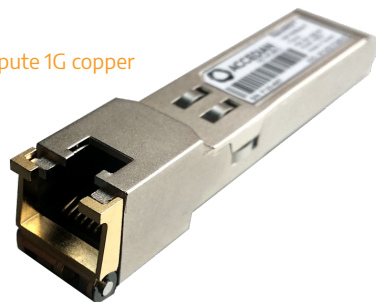
SFP compute 1G copper