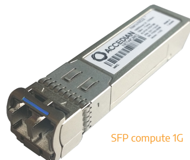
SFP compute 1G