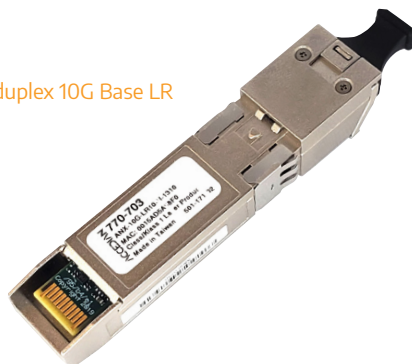
SFP compute duplex 10G Base LR